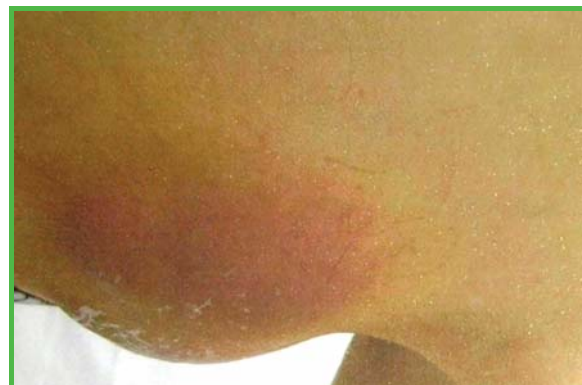
Figure 1. Clinical photo of a patient with a MRSA abscess

associated impetigo and folliculitis have also been reported. The severity of CA-MRSA SSTIs varies from mild superficial infection to deeper soft tissue infection requiring hospital admission 2,4,9,10 . Severe complications such as necrotising fasciitis, osteomyelitis, bacteraemia and sepsis syndrome have been reported although most of the infections usually remain confined to the skin and soft tissues (Figure 1). It is noteworthy that recurrent skin infections and clustering within the household are relatively common phenomena seen in CA-MRSA SSTIs 1,3 .