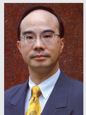
Dr. Kai-hung FUNG

This is an artistically rendered 3D CT scan. It represents a virtual endoscopic view inside the sigmoid colon showing a colon cancer (centre) surrounded by mucosal folds. With modern advanced medical technology, we can now see a cancer face-to-face using endoscopy or medical imaging.