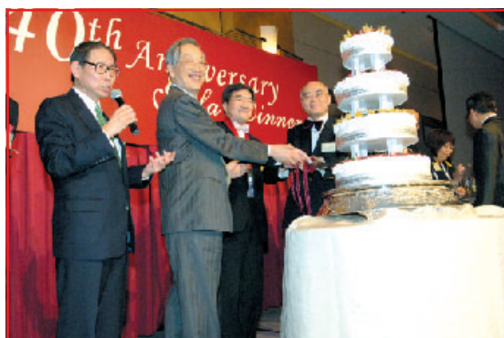
Cake cutting ceremony